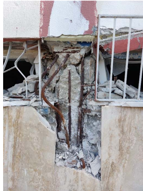
Fig. 5 Typical short-column type of damage, induced by continuous belt of low-height windows.