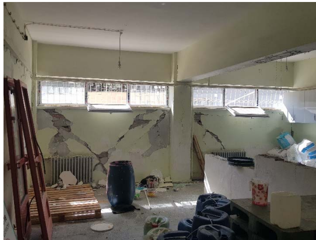
Fig. 7 Widespread diagonal cracking of infill and partition masonry walls.