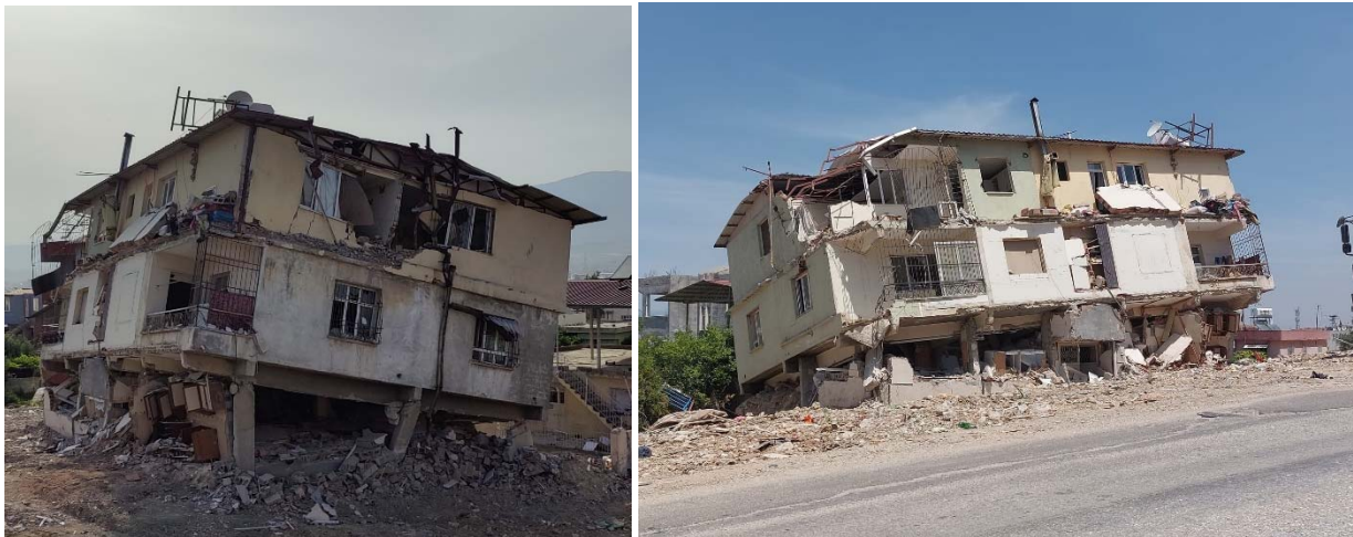
Fig. 10 RC building exhibiting soft-storey failure.