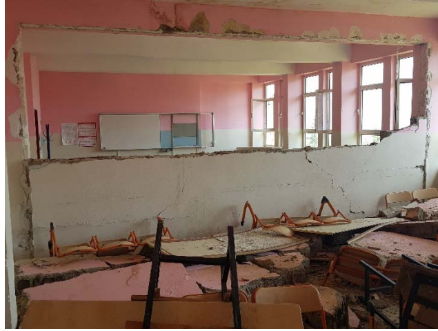
Fig. 8: Out-of-plane failure of infill and partition walls, with overturning.