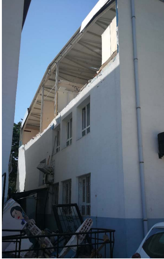
Fig. 3 Raised floor constructed with structural steel and truss-beam roof cover, insufficiently connected to the masonry wall parapets.