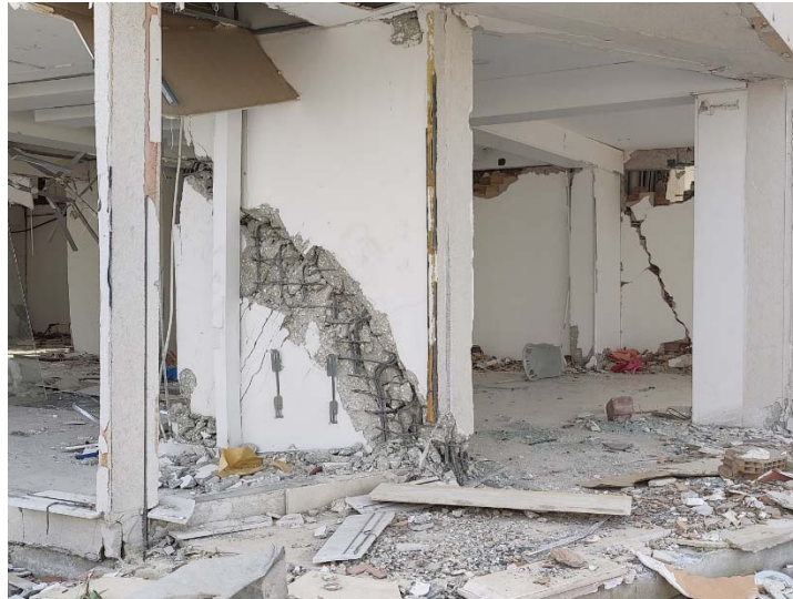
Fig. 11 Shear failure of an RC wall.