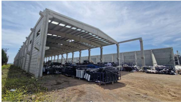
Fig. 13 – Side-view of the structure.

As shown in Fig.13 and 14, the earthquake-induced damage consists of a loss-of-support of the girders and consequent collapse of the roof cladding.