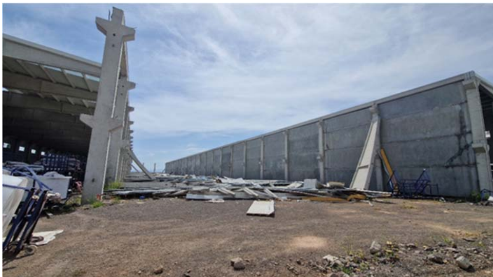
Fig. 14 – Collapsed roof cladding elements.