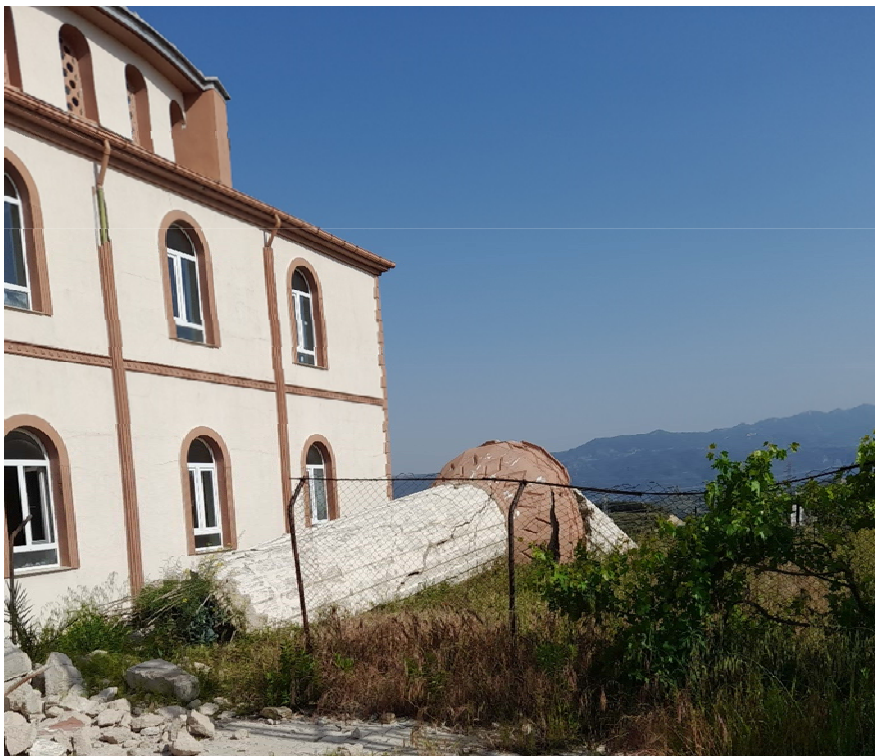
Fig. 12 Overturning collapse of a mosque's minaret.