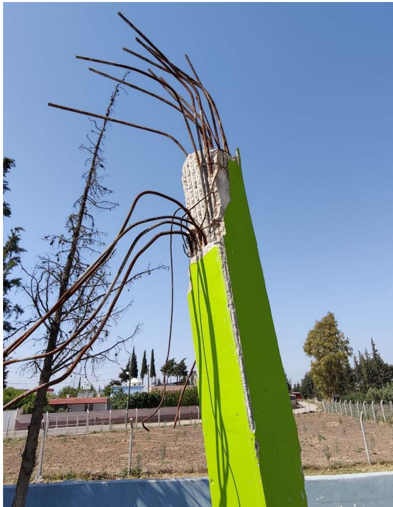
Fig. 2 – Remains of a column.

The building was demolished after the earthquake and there is no information on either its retrofit or the damage state.