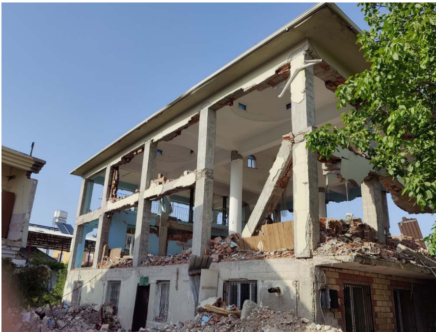
Fig. 8 Partial collapse of RC beam and floor slab.