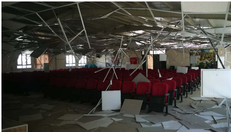
Fig. 4 Auditorium in raised floor with widespread damage of the false (suspended) ceiling.