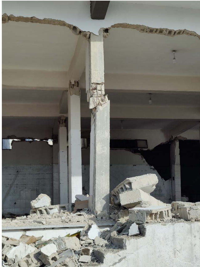
Fig. 9 Shear failure of an RC column.