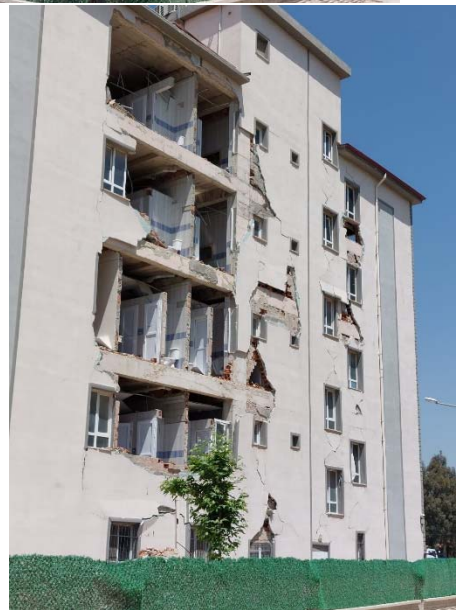
Fig. 5 Heavy damage of masonry infills, with out-of-plane collapse, corresponding to the front and back perimeter frames. Damage to the wooden roof cover with dislocation of roof tiles.