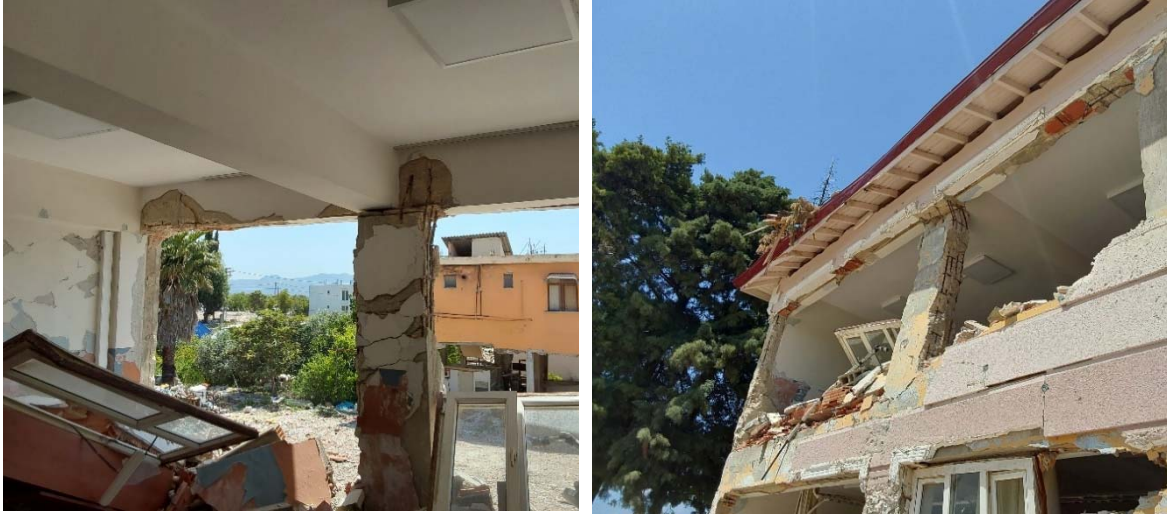
Fig. 6. Column top sheared-off at the construction joint, due to pounding from a (collapsed) adjacent structure: internal and external view (from left to right).